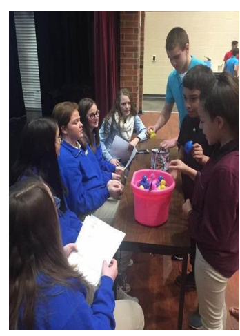
FFA members quizzing WMS students on their Agriculture knowledge with Duck Pond Trivia