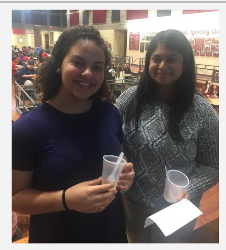
Taste Testers at Lunch

FOLLOW US ON SOCIAL MEDIA TO GET UPDATES ON CHAPTER HAPPENINGS