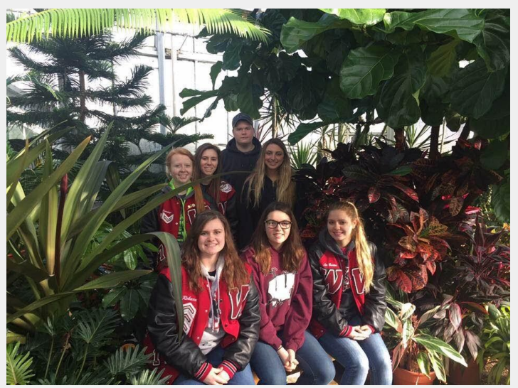
Wishing we were on a tropical island! Checking out OSU ATI's conservatory!