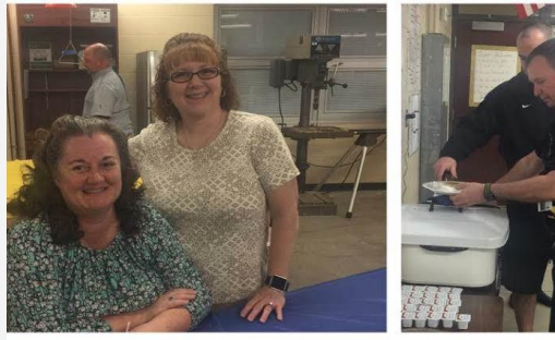
Teacher and Staff Appreciation Breakfast